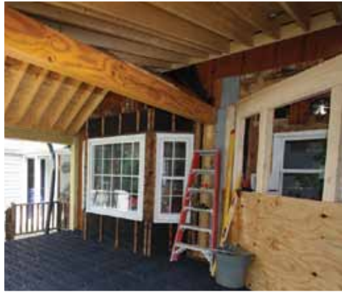
SilcaSystem™ installed on deck