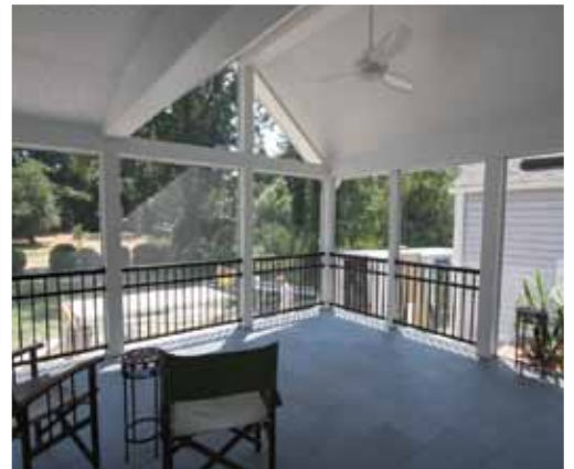
Screened porch and ceiling fan