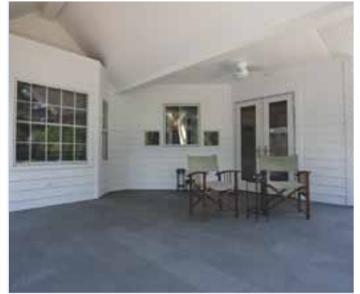
Slate tile installed over SilcaSystem™