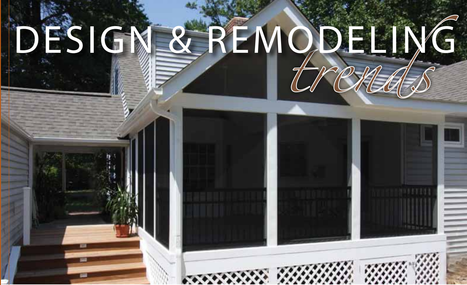
Above: The Larsen family deck.