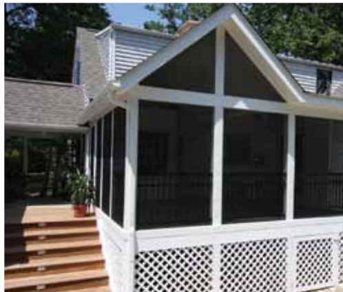
High grade, durable HardiePlank® siding