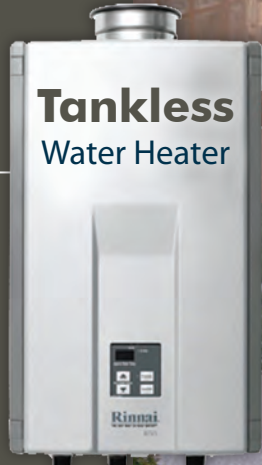
Tankless Water Heater